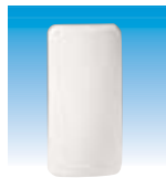
5815 Door/Window Transmitter