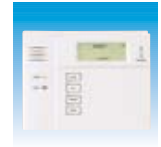
5828V Talking Fixed English Keypad

Honeywell's 5800 Series out-performs every other transmitter in the industry. All 5800 Series transmitters send supervisory messages to the control, as well as tamper and low battery notification. Built for year after year of reliable service, most of the devices include readily available, user-changeable lithium batteries, which provide longer life than conventional alkaline batteries and feature a demonstrated outdoor range of over a mile.