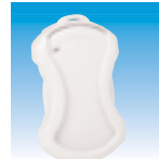
5802MN2 Dual-Button Personal Panic