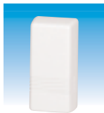
5816 Two-Zone Door/Window Transmitter