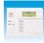
5828 Fixed English Keypad