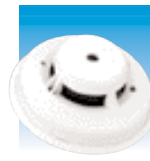
5808LST Low Profile Smoke and Heat Detector