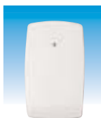
5853 Glassbreak Sensor