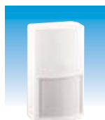
5897-35 Wireless DUAL TEC™ Motion Detector