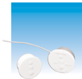
5800Micra Recessed Transmitter