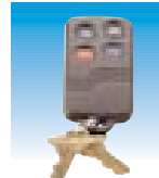
5804 Four-Button Key