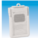
5802MN Single-Button Personal Panic