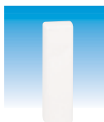
5819WHS Self-Contained Shock Sensor, Processor and Transmitter