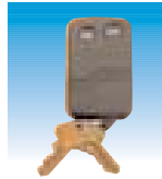
5804-2 Two-Button Key