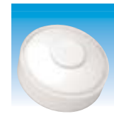
5809 Rate-of-Rise Temperature Sensor