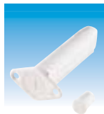
5818MN Door/Window Transmitter