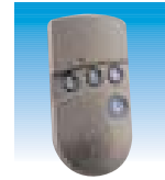
5804BDV Talking Bi-Directional Key