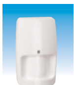
5894PI PIR Motion Detector with Pet Immunity